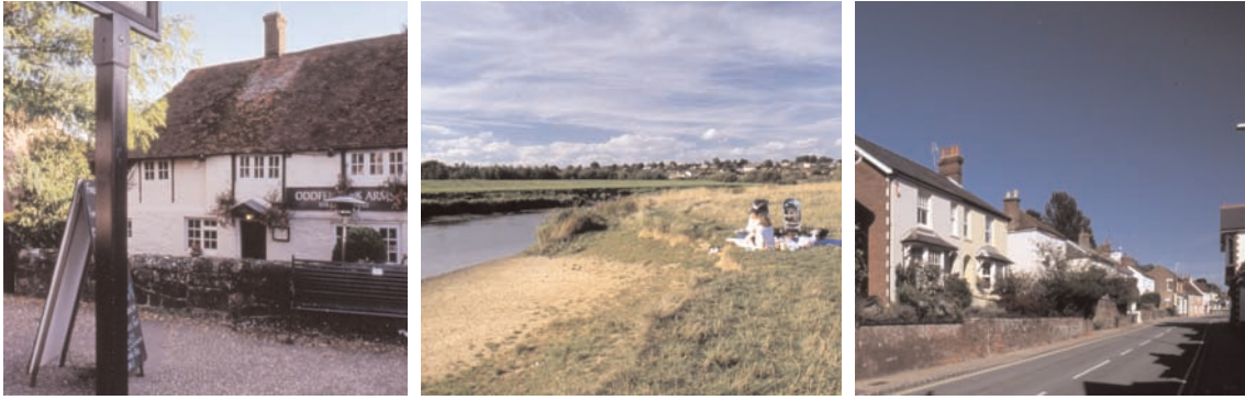
From left: Oddfellows Arms; Picnicking by the Arun; Lower Street

During the Middle and late Middle ages, glassmaking developed in the Mare Hill area – you will still find evidence of waste glass and the quarries today. The greensand ridge provided the local building materials of sand and stone while the oak forests to the north and west provided building and boat-making timber. The river continued to provide the spur to much of the livelihood for the area with fishing and as a waterway with limeburning and other wharf-side activities taking place. During this period the road that is now the A283, became an important route from Winchester to Canterbury – Stopham bridge was built at this time – and Pulborough provided inns and other services to travellers and their horses. The wealth generated during this period allowed many of the listed buildings that still survive to be built; the most important are St Mary's Church and New Place – there are well over 100 listed buildings of historic or architectural interest in Pulborough.