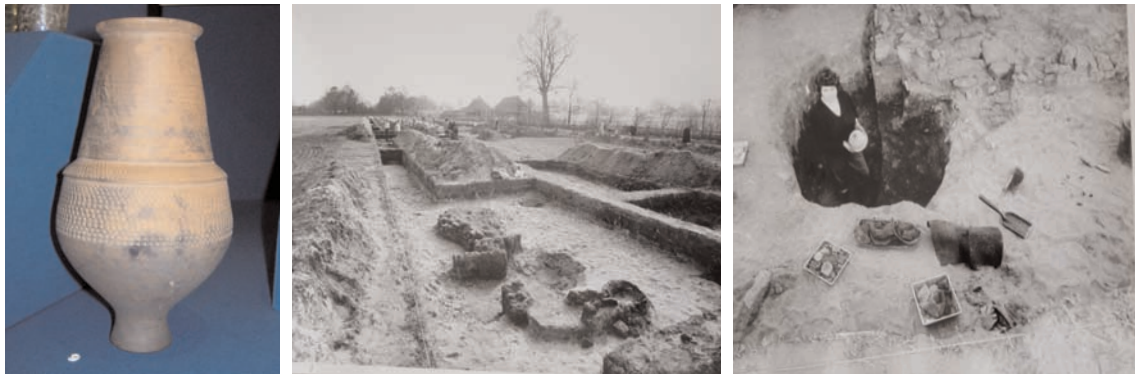
From left: Bathhouse excavated pot; Bathhouse excavation site

In addition, a huge find of over 1500 Roman coins in a silver Roman strainer was found in a ditch a little to the south of the bath house – these and other Pulborough finds are on display in Worthing museum.