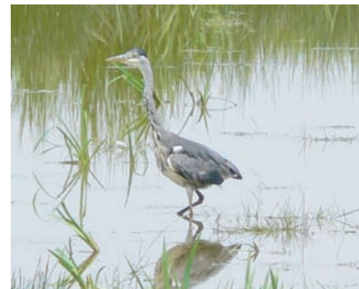
Kingfisher and heron in the brooks