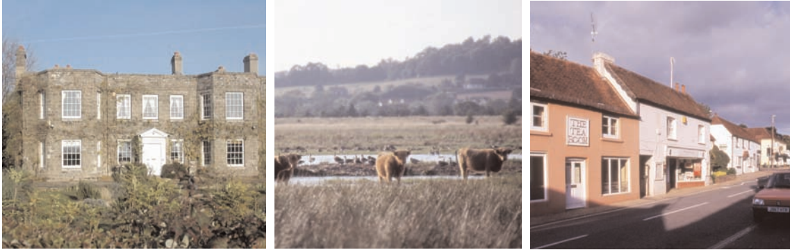
From left: The Old Rectory; Cattle in brooks; Lower Street

The landscape features that have dominated the history and development of the Pulborough area are the river and floodplain, the greensand ridge that runs east-west through Pulborough village and the fertile area to the north of the greensand ridge.