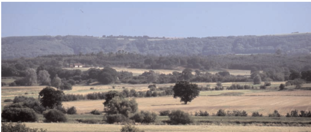
Viewpoint number 2: Brooks and South Downs

The field in front of you is a historic water meadow with a Roman Causeway crossing it, and beyond is the RSPB Pulborough Brooks Nature Reserve – you will see more of these meadows as you walk. The water-meadows were allowed to flood to fertilise the ground to improve the grazing – today parts are still flooded by the RSPB to encourage many species of migrating water birds such as the Bewick swans which come here from Siberia.