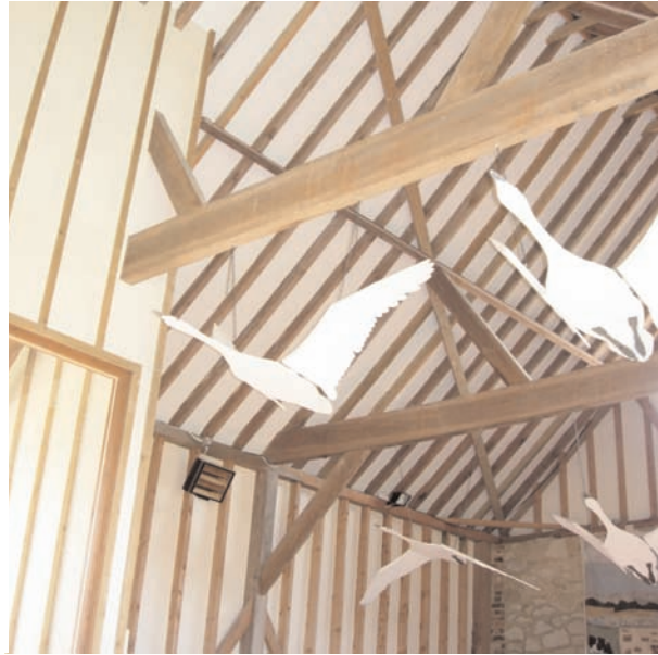
RSPB Visitor Centre