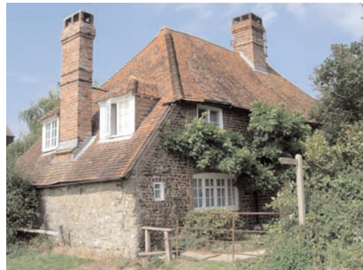
Viewpoint 3: Swift Cottage

The cottage on your right was originally a barn in which animals and their feed were kept; the barn which was timber framed was built about 350 years ago– the lane was then called Fowl Mead Lane after the field onto which it leads which was called Fowl Mead. The barn was converted to a house over 200 years ago; the timber frame was filled in with local ironstone rubble and a large central chimney with a bread oven was built. In the 1850's the house was converted to be two or three dwellings and the additional chimney built with its own bread oven. The cottage is now again one house in spite of the two front doors!