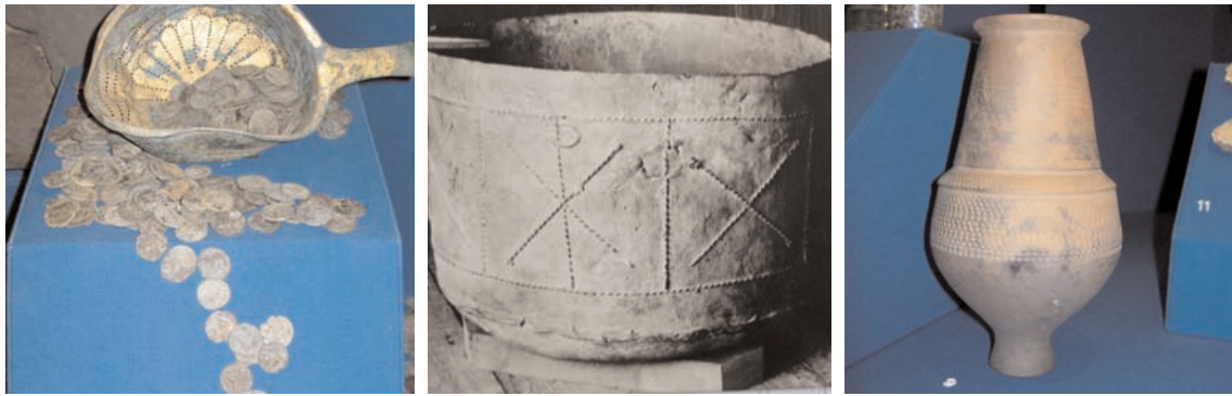
From left: Roman coins; a lead cistern; bath house pot

The route of the military road, Stane Street, from Chichester through Pulborough to London has long been a source of debate. It is straight to Pulborough and then nearly straight to London – but Pulborough is some miles off the straight line between Chichester and London!