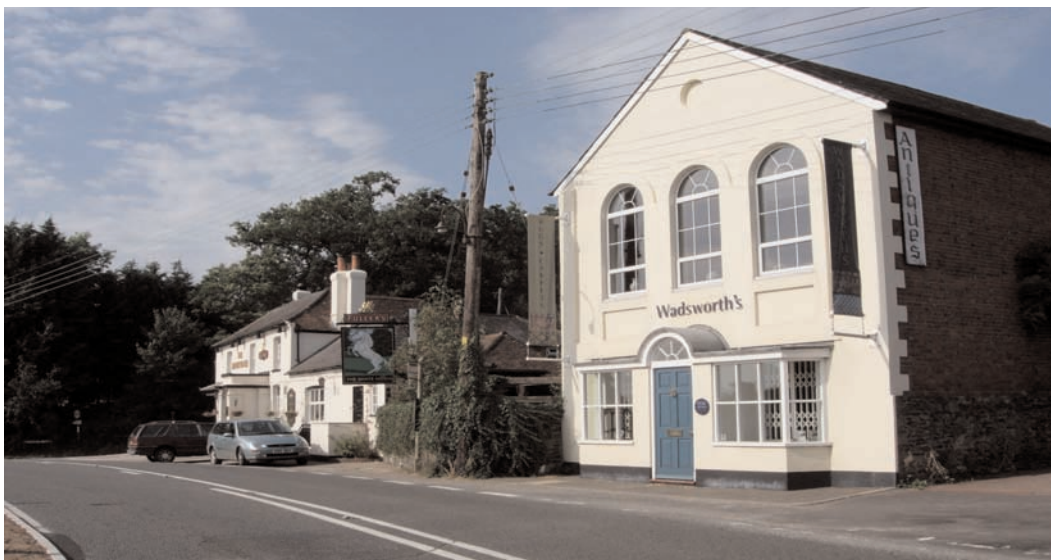
Old Chapel and White Horse

You may want to visit the pub for food and a drink before you continue walking back along the road back to your starting point – this is about 1.2 kilometres (¾ mile) to the car park and a further 1.2 kilometres (¾ mile) to the station.