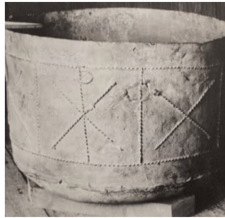
A lead cistern

If you look at the muddy banks of the River Stour you may see some “slide marks” where an animal or a swan has slithered into the water – both otters and minks have occasionally been seen around here – see http://www.yorkshire-wildlife-trust.org.uk/otters.htm for more information on otters. It was in this river that a large lead Roman cistern was found during dredging in 1943 – it can now be seen in the long gallery of Parham House.