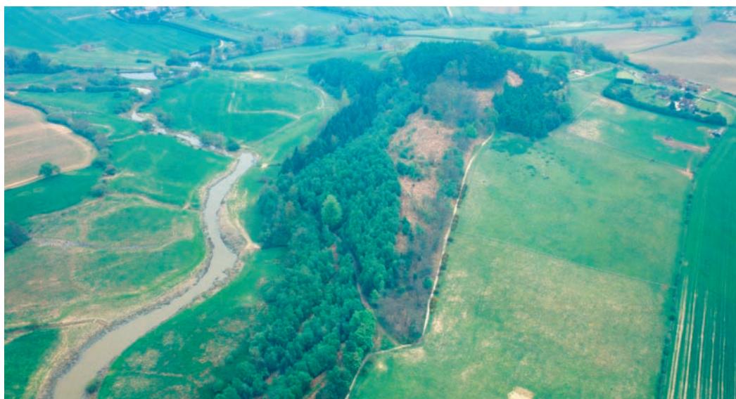
Norman Motte and Bailey

In the late 11th century the Domesday Book records significant dwellings here; they also defended this important place and controlled the area by building a castle on Park Mound.