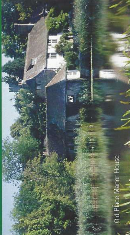
Old Place Manor House