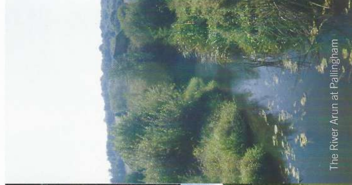
The River Arun at Pallingham