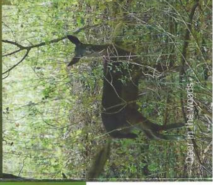
Deer in the woods